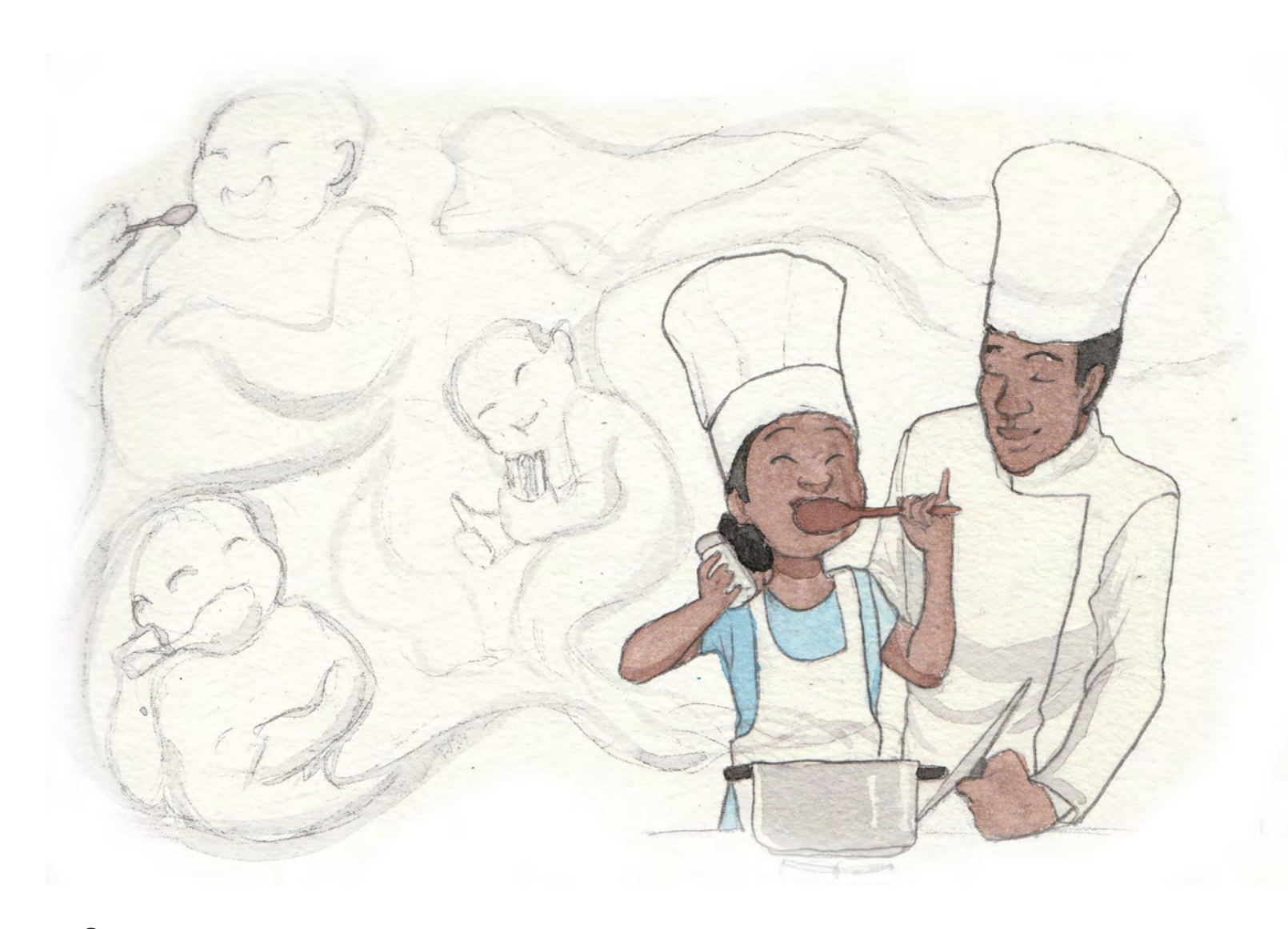
\mathbf{O} nce Upon a Time, a girl named Ella lived with her father. Her father owned a very successful catering business, and together with their staff, they spread happiness in the form of food through their whole city.